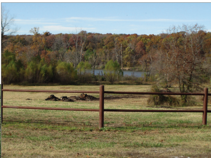
Above: Siloam Springs City Lake and trail development opportunities.

Below: Project links to downtown Gentry.