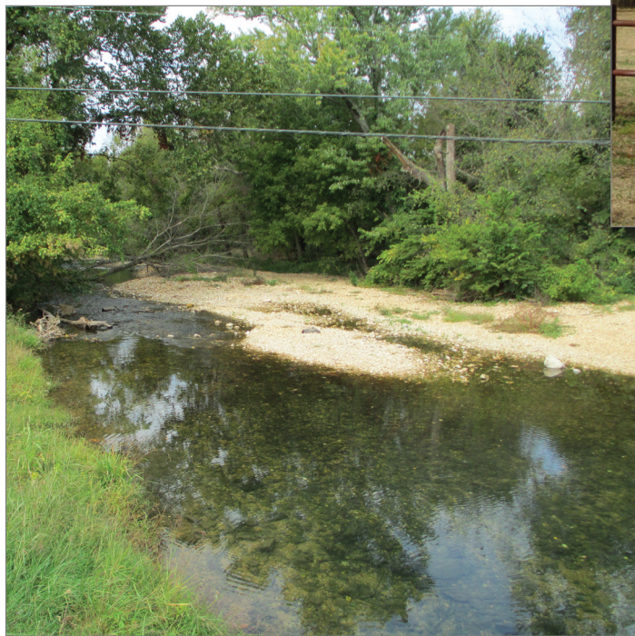
Above: Flint Creek between Gentry and Siloam Springs.

Total Planning-Level Cost Opinion $3,571,425 (see table 5.3 for details)